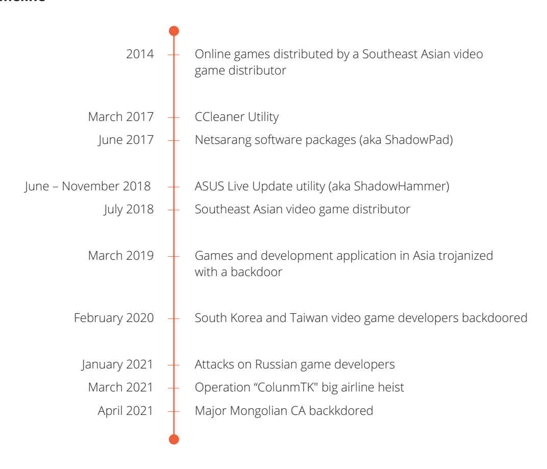
Figure 4: A timeline of reported operations carried out by APT41