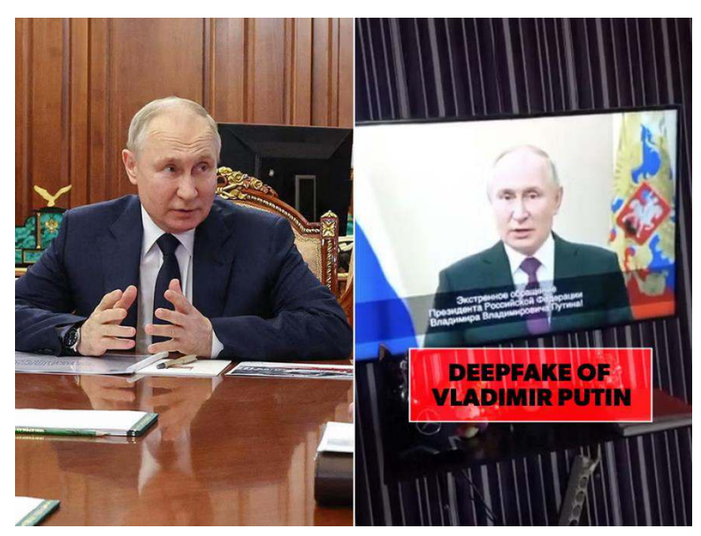
Figure 2: Deepfake of Vladimir Putin