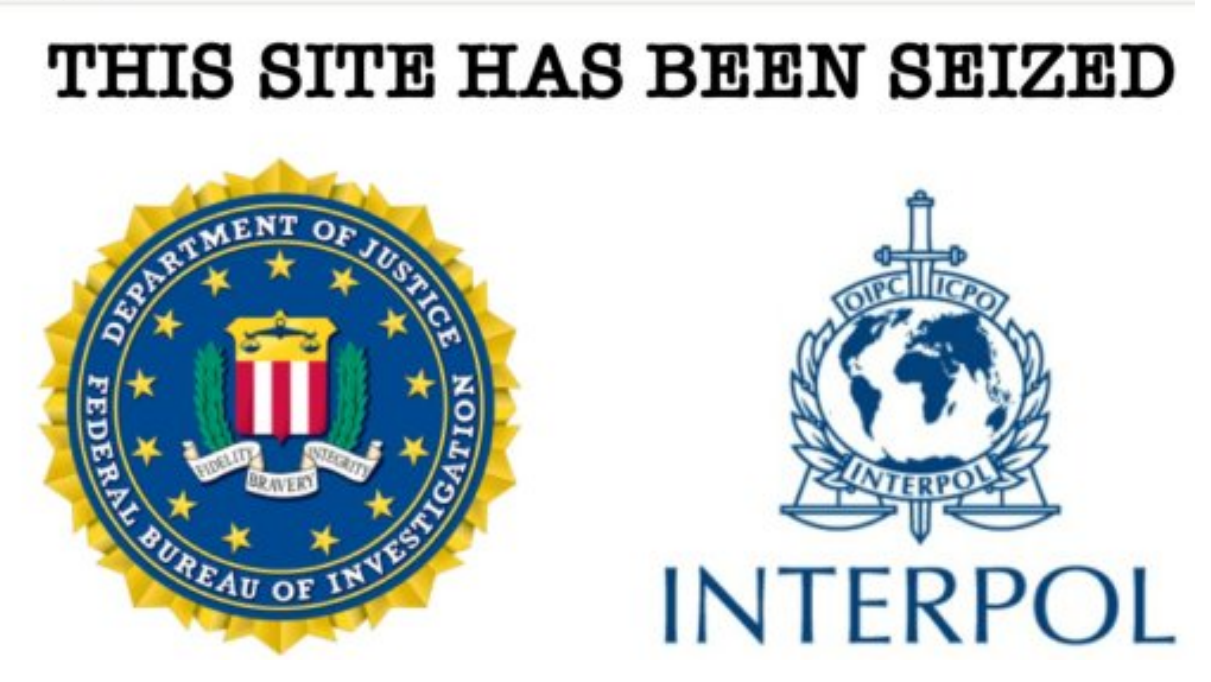
Image 2: An FBI and Interpol seizure notice appeared on a Joker's Stash blockchain domain on December 16, 2020.

In late October, the marketplace's routine activities were disrupted. JokerStash posted to claim that this was due to getting COVID-19 and spending more than one week in a hospital.