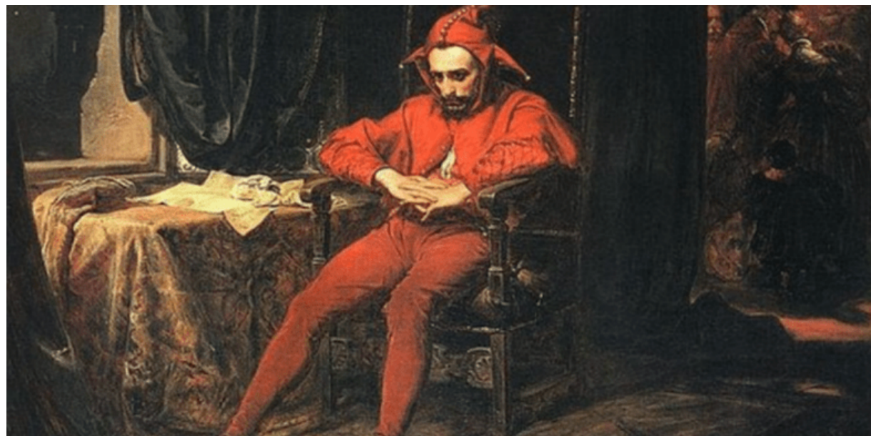
01 / 15 / 2021

January 15, 2021 FacebookTwitterLinkedInReddit