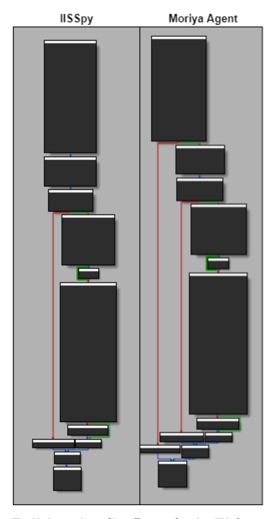
Fig. 18. Comparison of Install export function CFGs between IISSpy and Moriya